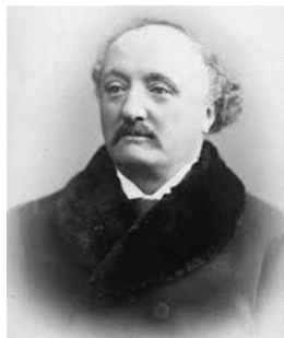
John Stainer (1840 – 1901)

London tube was a nightmare with escalators out of action, etc., but I survived. I would certainly do it again next year but definitely allow more time.